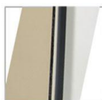
Double Layer 1.2mm sheet metal surface, melamine board inward.